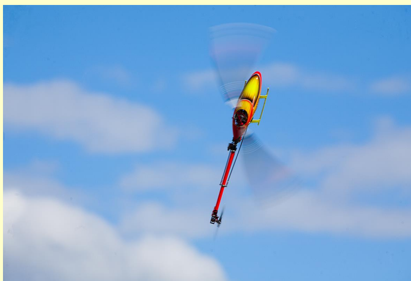
Remising the Protos 360. Ray has such pleasant memories flying this little beast...