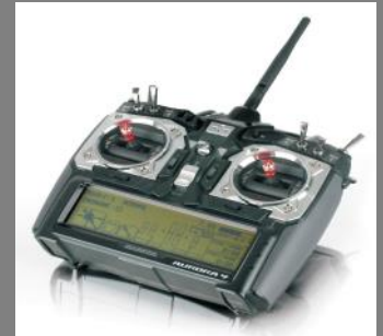
HITECH AURORA 9, 2.4