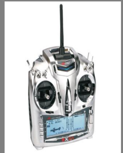
NEW JR 11X 2.4